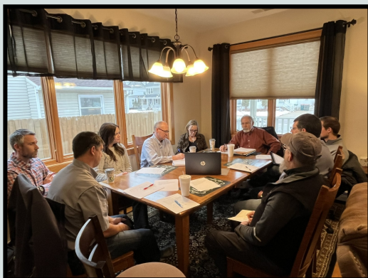
The team hard at work during our first kickoff session at the Hands of Compassion.