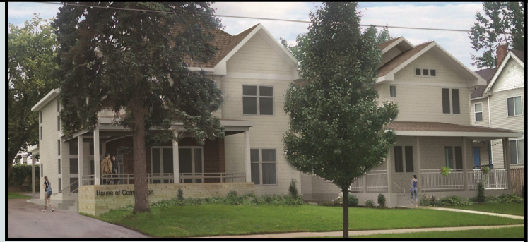
Digital rendering of our upcoming expansion house

Please keep us in your prayers as we continue this fundraising campaign so that we can be a blessing to the people who come to us in need. The board and our staff want to say thank you for the incredible gifts that you have given our ministry. We are able to move to the next stage of this project because of your wonderful support!