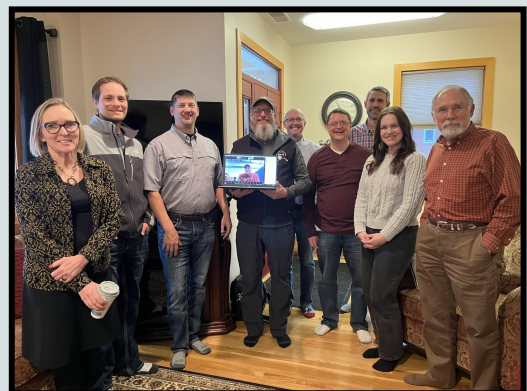
Architects, civil engineers, builder, and Hands of Compassion board members present at our first kickoff meeting for the new expansion.